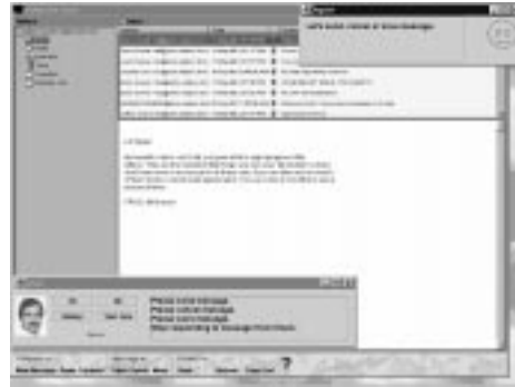
(a) A setting for human-computer collaboration.